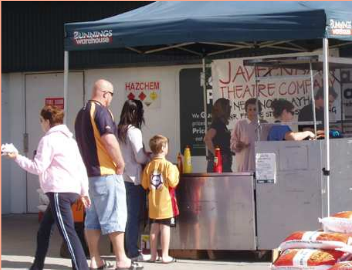
Javeenbah volunteers staff the barbecue at Bunnings, Nerang, to cater for a Saturday audience.