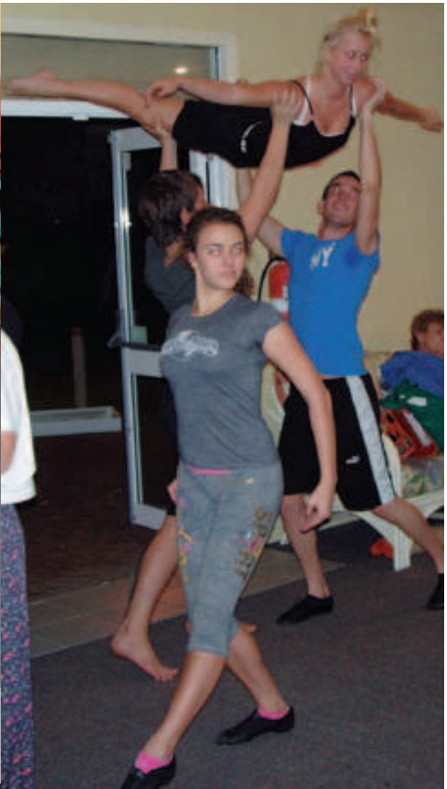
Dance rehearsals under way in Javeenbah's foyer for Sweet Charity . Above and right: Rich Man's Frug .